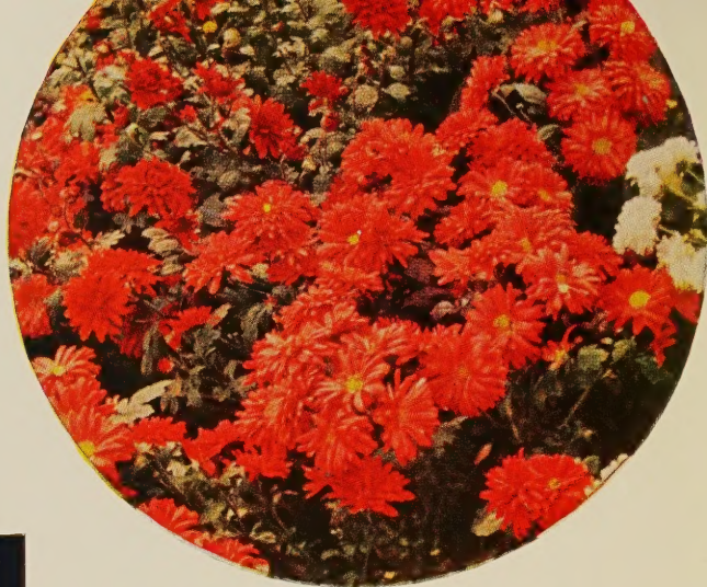
ROUGE CUSHION. 60c each; 3 for $1.50